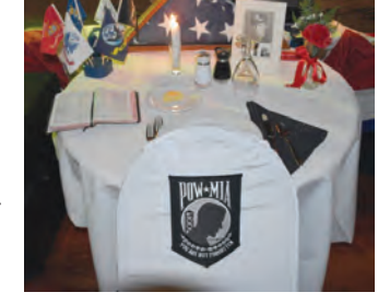
Missing Man Table