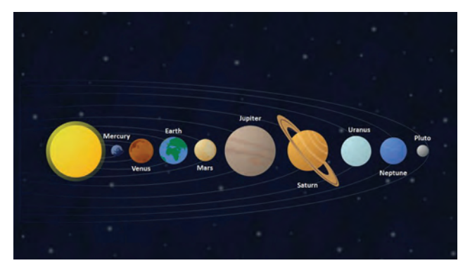
Our Solar System

The flight time from Venus to Mars will take a little