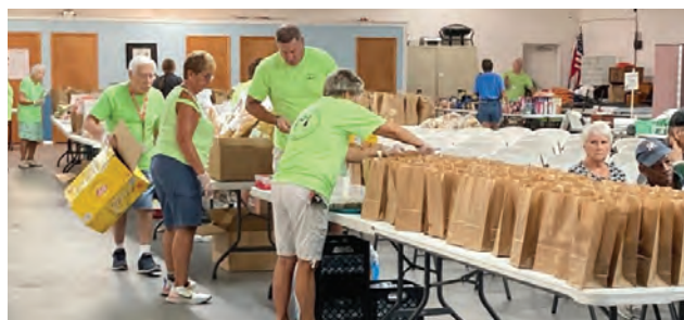
Clients wait to shop. Volunteers all wear "lime green" T-shirts.