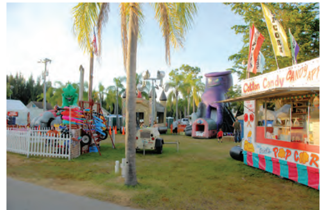
Carnival area for kids