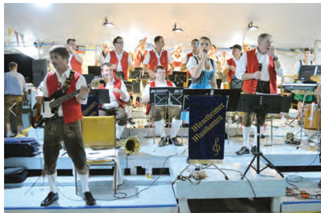
Festival tent and outside Biergarten – three stages, two dance floors, nonstop live bands and German music

In 1973, the club formulated plans to build its own clubhouse. The members contributed both financially and physically to the construction of the building. On March 17, 1974, local dignitaries participated in the groundbreaking for the new clubhouse, using green painted shovels in tribute to St Patrick's Day. Four hundred people attended the ceremony. In