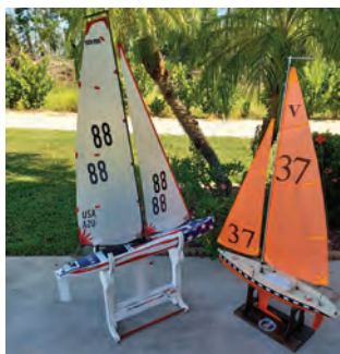
White boat, new class boat, Dragon Flite 95; Orange boat, original club boat, Victoria